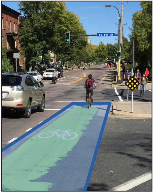
Intersection with Bicycle-Detection Zone Graphically Overlaid

The EMTRAC Bicycle Detection System includes a mobile-device app to help deliver accurate detection for bicyclists. The app recognizes when the cyclist is within a pre-defined detection zone and notifies the EMTRAC Priority Detector, which is installed in traffic-controller cabinets.